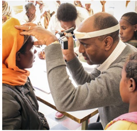
At a screening camp organised by Fitsum Berhan Eye Clinic. ETHIOPIA

poor and those who struggle to come to the hospital, for whatever reason.