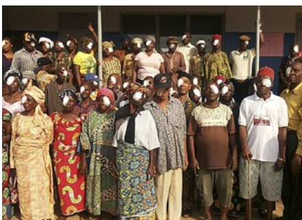
After cataract surgery at Deseret Community Vision Institute. NIGERIA