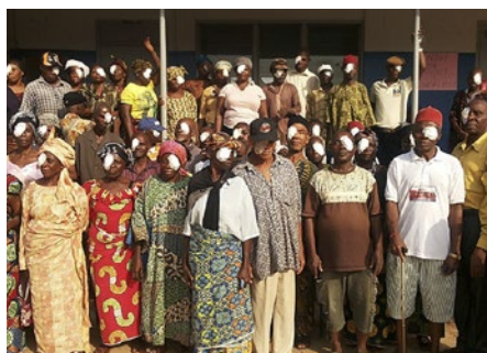
After cataract surgery at Deseret Community Vision Institute. NIGERIA