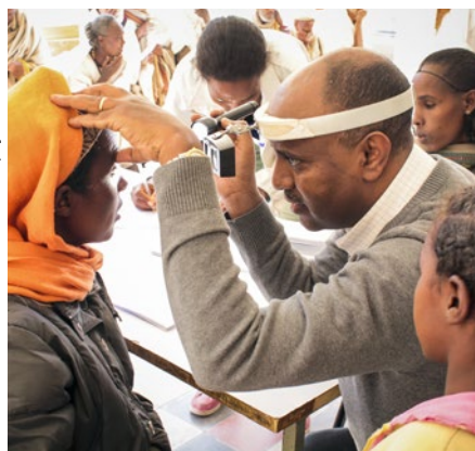
At a screening camp organised by Fitsum Berhan Eye Clinic. ETHIOPIA

poor and those who struggle to come to the hospital, for whatever reason.